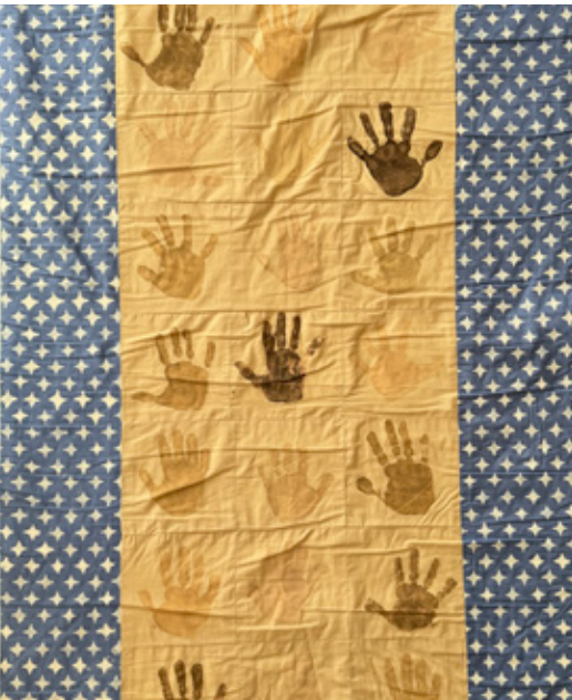
4E: 4E's Community Tapestry!