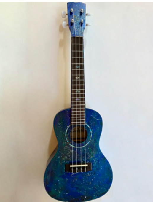
T1: Shine Bright