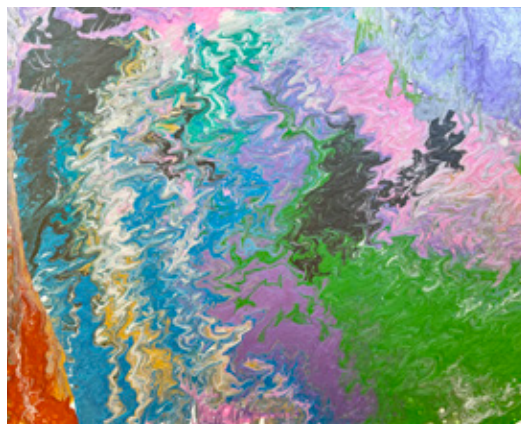
T2: T2 Pours Paint