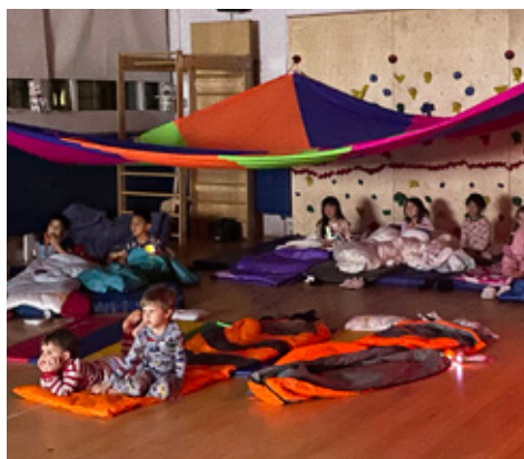
Ultimate Kids' Overnight