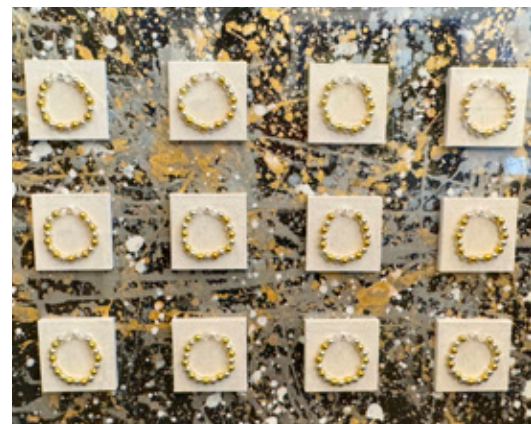
T3: Lifelong Friendships!