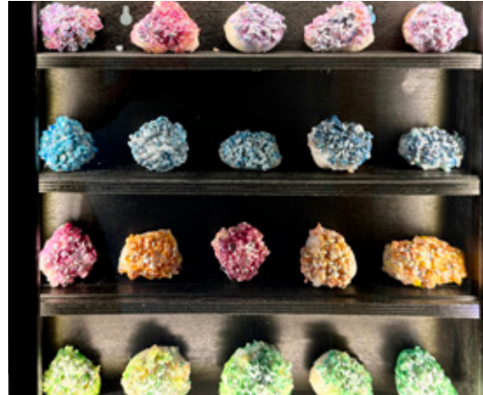
3W: Enchanted Crystal