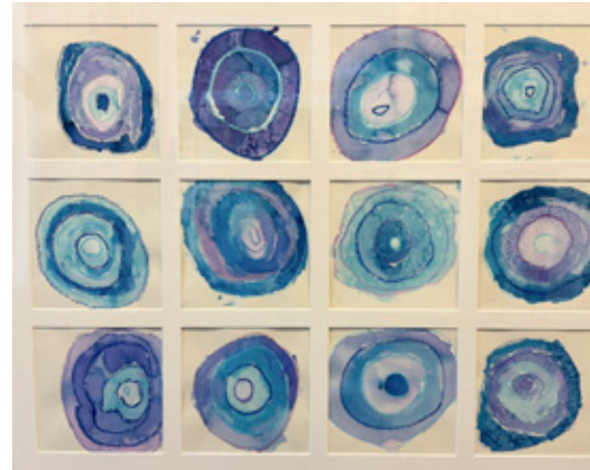
Garden: Garden's Geodes