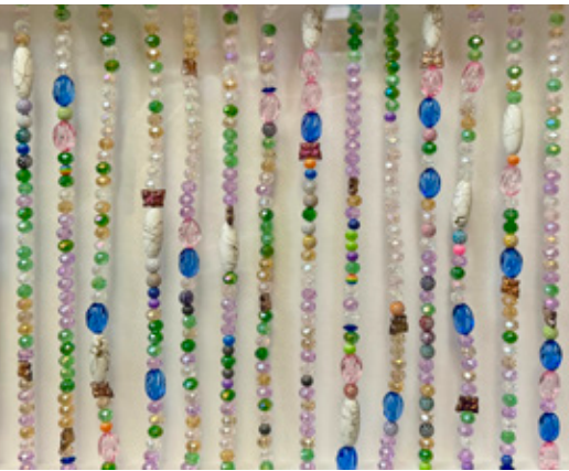
1W: Friendship Gems: Beading Together, Shining Forever