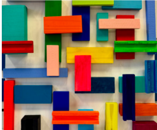
3E: 3E's Wooden MasterPEACE!