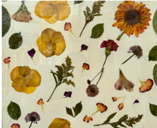
4W: Forever Bouquet