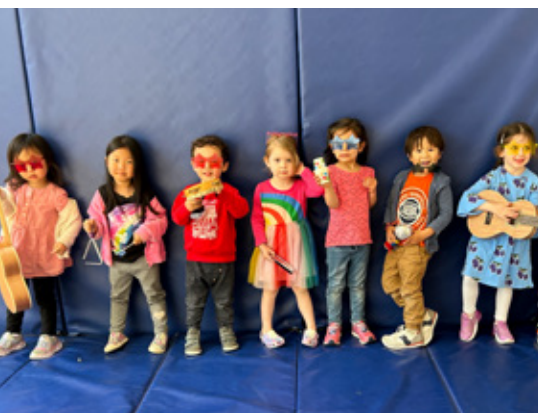
WSMS School of Rock